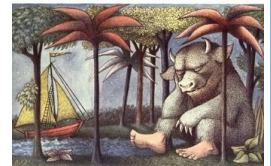
STORY AND PICTURES BY MAURICE SENDAK