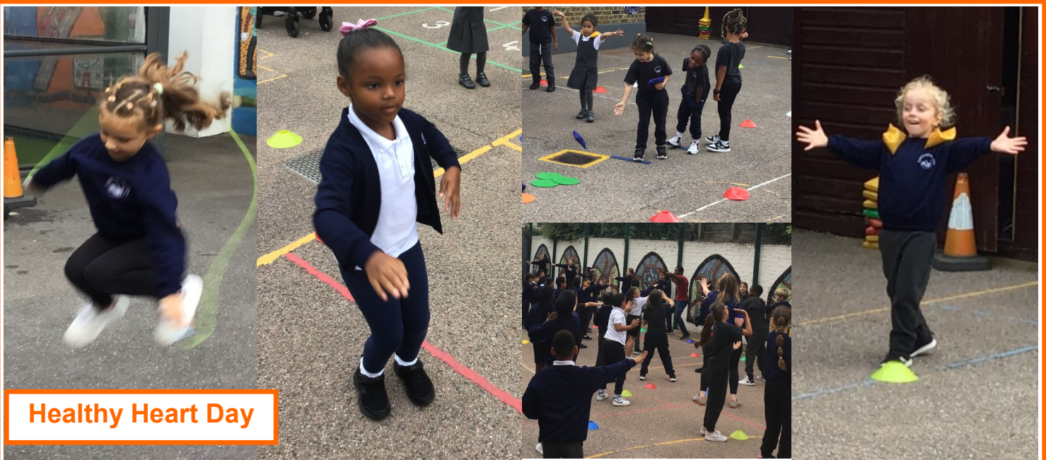
Healthy Heart Day